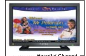
..... Hospital Channel