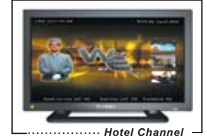
..... Hotel Channel