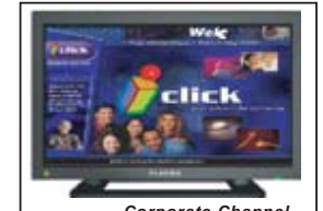
..... Corporate Channel