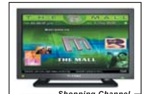
..... Shopping Channel